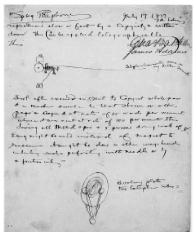
The "18 July" and "17 July" pages in hypothesized original order.

ceptually like pieces of a jigsaw puzzle; the result is awkwardly phrased, to be sure, but no more so than usual for Edison. I can think of no really conclusive way to prove or disprove this hypothesis; apart from the problems of provenance I've already mentioned, the "18 July" page is known to survive only in facsimile, so its inks and paper characteristics can't be compared with those of the "17 July" page. Still, let's consider the potential implications. If the page signed and dated on 18 July was written before a second page signed and dated on 17 July, then the page dated 18 July must also have existed on 17 July, even if it remained undated until the next day. In that case, Edison's first sound playback experiment would necessarily have taken place on or before 17 July, and not on 18 July as generally believed. The "17 July" page would also represent Edison's first effort to devise a use scenario for a principle he had just discovered or demonstrated through experiment (as documented on the "18 July" page), rather than speculation into a process he hadn't yet tried, which seems intuitively to make more sense and is also more consistent with later reminiscences. 16